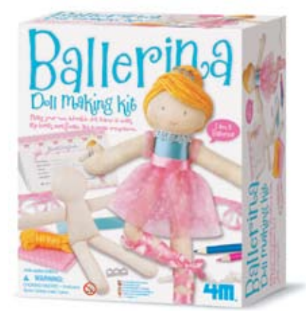
00-02731 Ballerina Doll Making Kit

Check out for other easy-to-do doll making kits. Make adorable fairy, mermaid and princess and create your very own gorgeous doll collection.