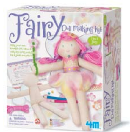
00-02732 Fairy Doll Making Kit