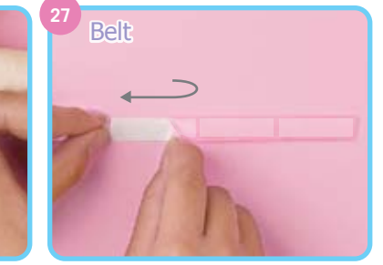
ribbon and peel off the backing.