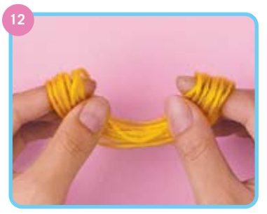
Apply some craft glue to the back and Take the 240cm piece of wool. Wind the Gently slide the wool off your palm and

front of the ballerina's head and fix her wool around a book (approximately tie a knot. hair into position. Leave it to dry for 12cm in length) as shown in the diagram.