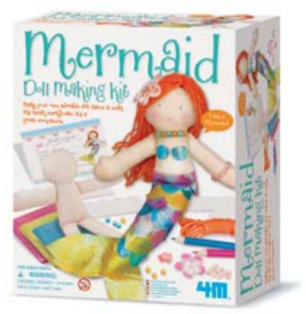
00-02733 Mermaid Doll Making Kit