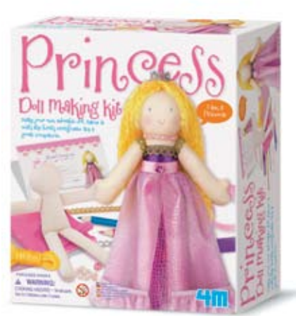
00-02746 Princess Doll Making Kit