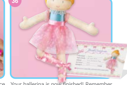
Repeat the same steps on the other leg. Take the face stencil provided and place Your ballerina is now finished! Remember You have now completed your it on the doll's face. Use the coloured to give her a name and fill in the birth pencils to colour the eyes blue and lips certificate.